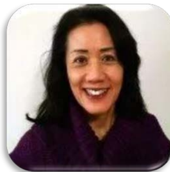
Director Operations and Maintenance (Retired) Alexandria City Public Schools